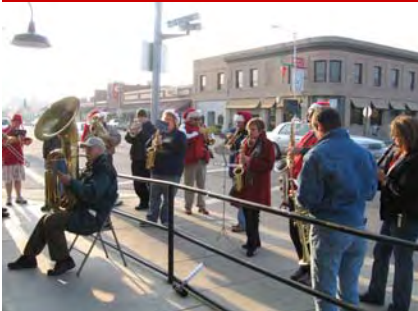
CHOWCHILLA UNION HIGH ALUMNI BAND PLAYING DURING SHOP CHOWCHILLA DAY