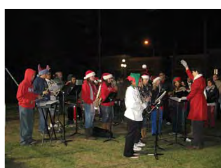
WILSON BAND PLAYING AT THE ANNUAL LION'S CLUB TREE LIGHTING