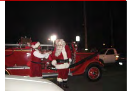
SANTA AND MRS. CLAUS ARRIVING TO DELIGHT EVERYONE AT THE TREE LIGHTING