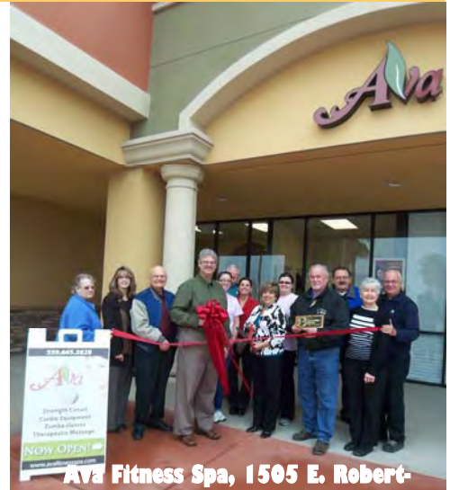
Ava Fitness Spa, 1505 E. Robert-