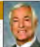
America's Top Authority on Selling

How to Meet the Customer's Needs - Even in Tough Times