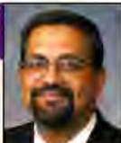
#1 Communication Skills Expert

How to Create an "Information Loop" that Puts You in the Know