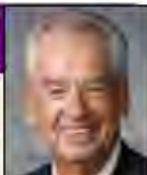
America's #1 Motivator

How to Change Your Life with an Attitude of Gratitude How to Get Everything You Want