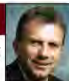
The Greatest Quarterback in NFL History

How to Turn Workplace Stress into Gridiron Success How to Have the Commitment and Passion of Champions How to Create a Winning Mindset Principles for Stellar Performance