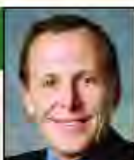
Legendary President of Microsoft

Inflation-Proof Your Market: How to Reduce Costs and Increase Your Profits Anyway!