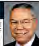
World-Famous Soldier Statesman

How to Move from Commanding to Connecting Inexpensive Incentives that Increase Performance How to Rapidly Expand Your Circle of Influence